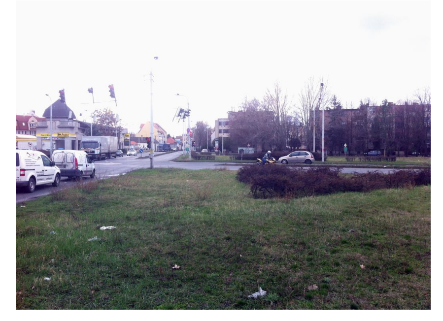
Figure 3. Kecskemét Buda Kapu Crossing (a contaminated place by toxic elements)