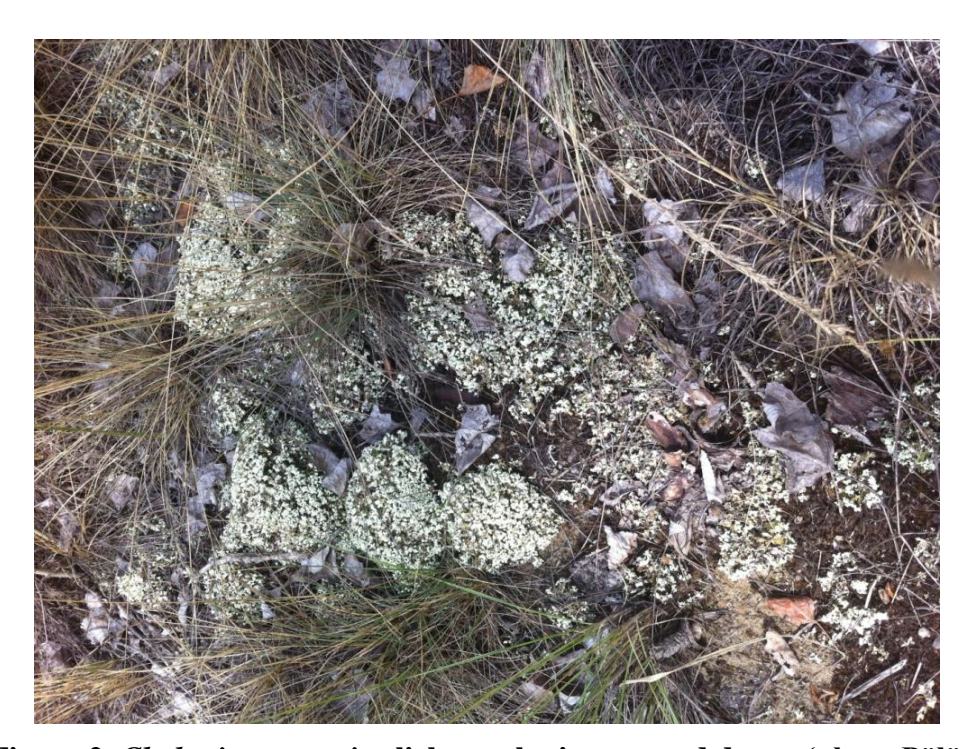
Figure 2. Cladonia magyarica lichen colonies on sand dunes

Lichen colonies were collected from the Kiskunsági National Park ( Figure 2 ) and were placed in Kecskemét Budakapu Crossing ( Figure 3 ). This later placed is heavy polluted because of the traffic.