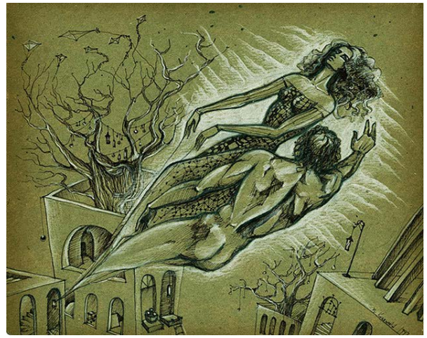
Figure 2. The Master and Margareta (Illustration)

In the Russian literature after Pushkin, we can find numerous instances for the representation of Demon (Devil, Satan etc.). Such works are as follows: a novel entitled "Devils" by Dostoevsky, the devil hallucination of Ivan Karamazov in his work of "Karamazov brothers"; Fyodor Sologub's short story "The Petty Demon" " The Little Demon"; Vasily Shukshin's narrative "Until the Cock Crows Thrice"; Woland, the representation of the Satan in "Master and Margareta" by Bulgakov.