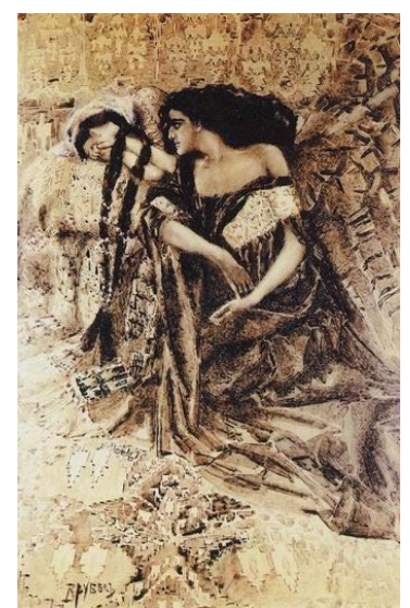
Figure 1. Tamara and Demon by Mikhail Vrubel

Another contemporary and follower of Pushkin is Lermontov whose life-work is determined by the Demon-experience. It is well-characterizing that during his 27 years of his life he wrote eight variants of his poem "Demon". But most of his poems, dramas and prose are profound, diverse and powerful compositions of this experience. Plenty of Lermontov's lyrical poems were set to music by his contemporary-, and other later composers. Based on Lermontov's narrative poem entitled "Demon" Vrubel painted a series of pictures, and it also had a significant effect on Rubinstein's music as well.